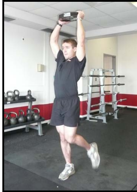
Figure 6: Walking lunges with a plate overhead demands control of the core. Keep the core engaged throughout to limit trunk sway.