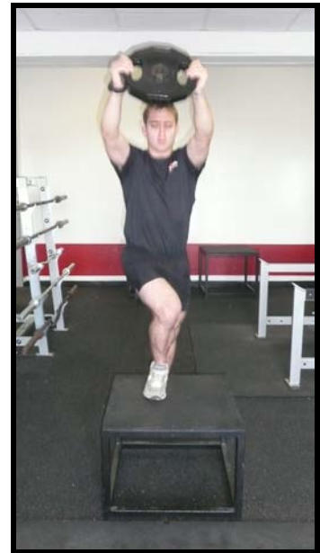
Figure 5: Use a weight as shown to counterbalance bodyweight and allow the trunk to stay perpendicular to the ground. The pictures on the left and center show optimal knee position. The picture on the right demonstrates poor right leg stability, as the knee drifts too far inward.