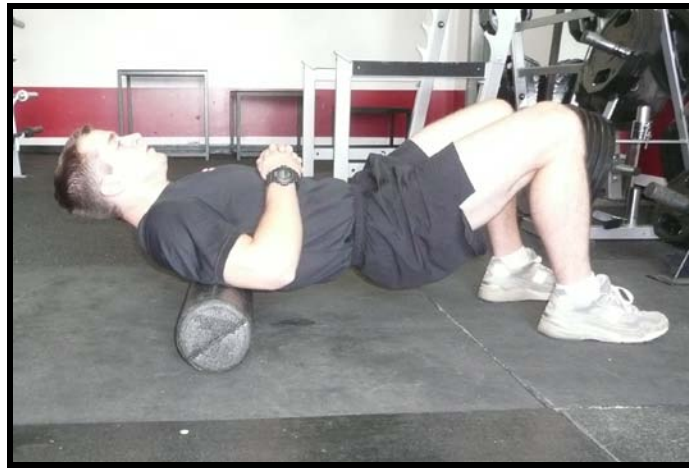
Figure 8: The foam roll can be used as shown to mobilize stiff thoracic joints and massage the mid back muscles.

Mid Back: The mid back or thoracic spine is where the ribs attach. This area is inherently stable. Our concern here is for lack of mobility. When the mid back loses mobility, it affects both the low back and the shoulders. In fact, many shoulder conditions get remarkably better by simply improving mid-back mobility through exercise or manipulation. Recovery Drill movements such as the scorpion and rotational spine stretch will aid in improving mid-back mobility. Many Rangers also report benefit from use of the foam roll. The battalion therapists are trained to manipulate the spine if necessary.