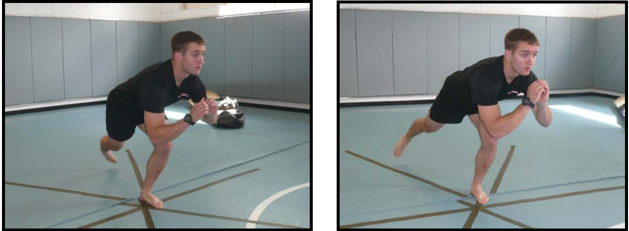
Figure 7: Balance and reach drills. The picture on the left demonstrates reach to the posterior left quadrant. The picture on the right shows reach to the posterior right quadrant. Both challenge hip mobility and stability. Note that the trunk and arms are forward for counterbalance. The rear foot does not touch the ground. This drill can also be used to assess side-to-side difference that might indicate an imbalance.

Low Back: Everyone has heard, “Lift with your legs, not your back.” It is trite, but true. The big muscles of the legs are big for a reason – to generate power. Ideally this power is transmitted up to the arms by a stable trunk. If the trunk is not sufficiently stable, energy is lost and spinal tissues are strained.