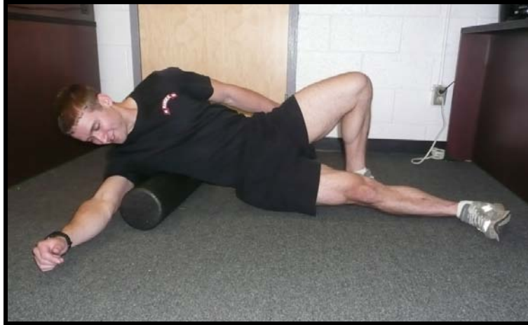
Figure 9: Tight muscles around the shoulder blades can limit overhead motion. Here the foam roll is used to increase extensibility of the teres major.

Shoulder: In contrast with the other ball-and-socket joint, the hip, the shoulder is inherently unstable in its shallow socket. Stability is created primarily through the muscular action of the rotator cuff. These relatively small muscles connect the shoulder blade with the upper arm. They enhance stability not through the production of huge force, but rather by exerting their force at the right time. For this reason, rehabilitating the shoulder is not as simple as strengthening the rotator cuff. We offer some suggestions below. Ironically for such a mobile joint, shoulder problems often involve a lack of mobility, especially internal rotation (parade rest position is an example). Corrective stretches for increasing internal rotation are best learned one-on-one with your therapist.