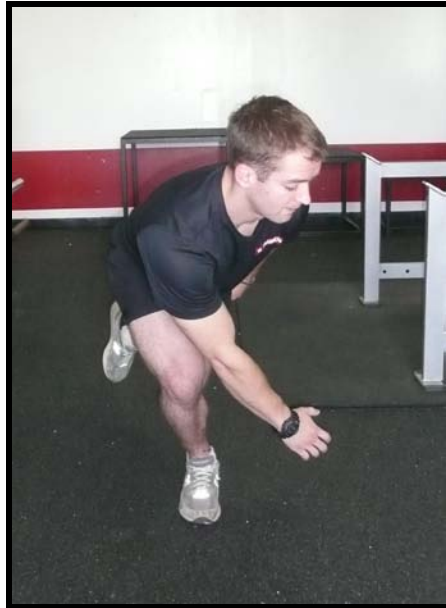
Figure 4: The single-leg squat with medial rotation. This exercise challenges hip and knee stability. Do not let the knee of the stance leg drift inward. Start with short, slow movements and gradually add range of motion and speed as proficiency improves.