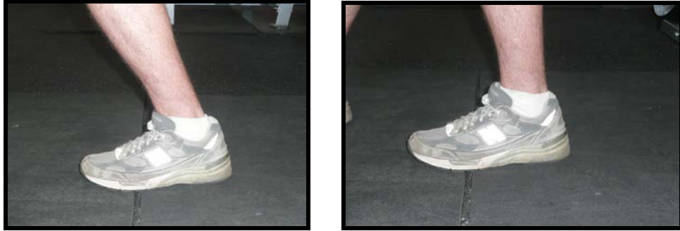
Figure 2: The picture on the left shows optimal ankle flexion just before the heel rises during the walking stride. The picture on the right shows limited ankle flexion and is associated with an inefficient stride.

Knee: The knee is a hinge joint that permits only slight side-to-side and rotational movement. When those movements are excessive, bad things happen to good ligaments. So, at the knee, the concern is for having sufficient stability. The most common direction for excessive mobility is medial (the knee drifts inward creating a knock-kneed effect). We see this most clearly during single-leg stance squatting or during slow, controlled step-ups. Interestingly, it is not so much weak quadriceps that leads to excessive inward knee mobility, but rather it can usually be traced to weak hip stabilizers.