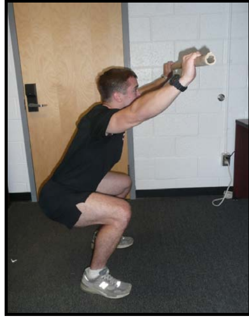
Figure 12: On the left is the Deep Squat test from the Functional Movement Screen. Note that the stick is maintained vertically aligned with the feet, representing good mobility/stability through the trunk and shoulders. For the max score of “3”, this is the position you must achieve. On the right, the stick is well forward of the body, indicating deficits in mobility, stability, or both.