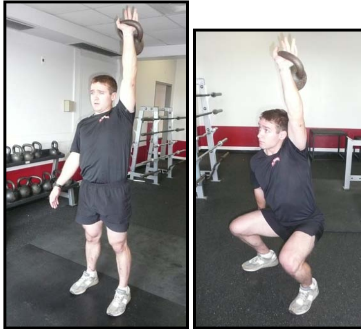
Figure 10: Overhead squatting is a challenge to stability throughout the core and shoulder girdle. Ensure you have sufficient shoulder mobility to keep the weight vertically aligned with the feet, not in front of the body.