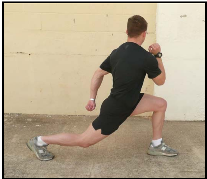
Figure 6: The single-leg squat variation shown on the left is a strong challenge to the hip stabilizers. The picture on the right shows excellent mobility of the right hip into extension during a lunge. This is also the position for stretch of the hip flexors of the right leg.