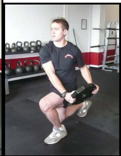
Figure 7: Rotating the plate across the forward leg adds further challenge to core stability. Keep the core engaged throughout to limit trunk sway.