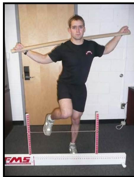
Figure 13: In these pictures, the Hurdle Step evaluates mobility of the right hip and stability of the trunk and left leg. Optimal execution is shown on the left. The picture on the right demonstrates 1) excessive hip rotation to clear the hurdle, and 2) poor control of trunk indicated by the tilting stick.